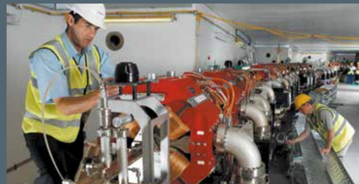
High Energy Physics