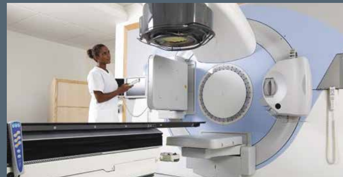
Industry and Medical Processes